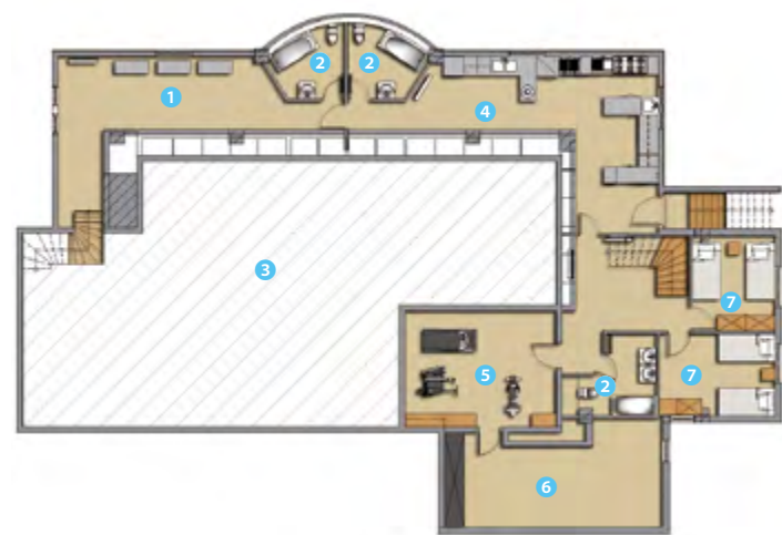
Basement floor plan